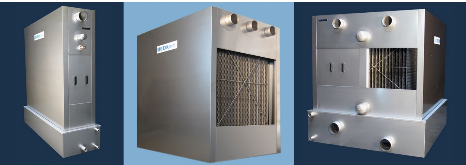
PIC LEFT TO RIGHT BUCOdelot compact system with tank, power 100 kW - dx; BUCOdelot typ M, power 1000 kW; BUCOdelot typ B, power 2000 kW