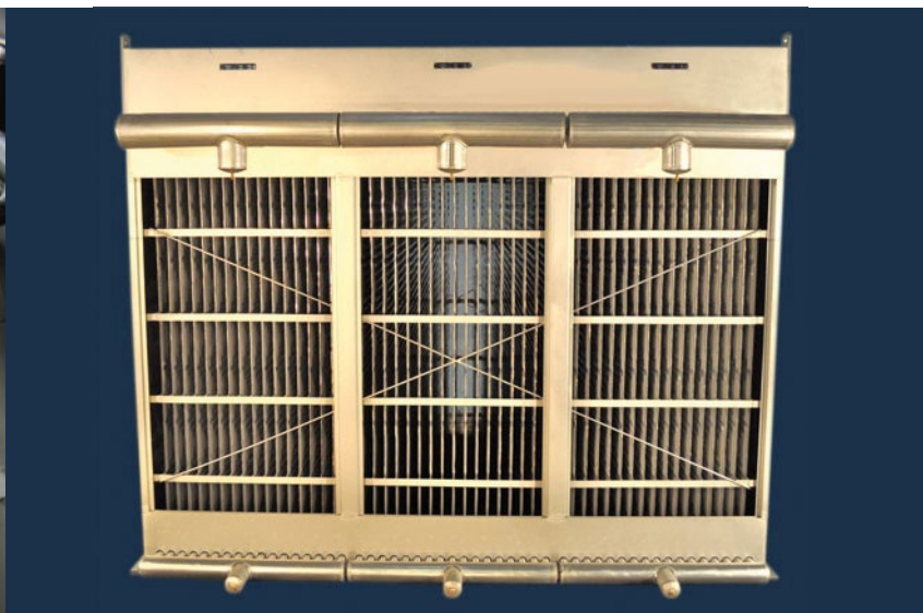
PIC LEFT ice silos with 5000 kWh storage capacity each PIC RIGHT ice maker for 6 to/h. At 10 h buildup time 5600 kWh