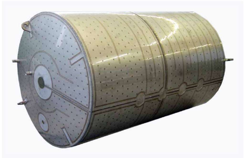
Melting through for wax, with round corners at edges and collars