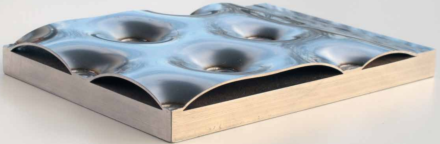
Basis of a tank wall: single embossed heat exchange panels