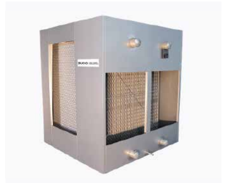
Left to right: BUCOdelot compact system with tank, power 100 kW - dx; BUCOdelot typ M, power 1000 kW; BUCOdelot typ B, power 2000 kW